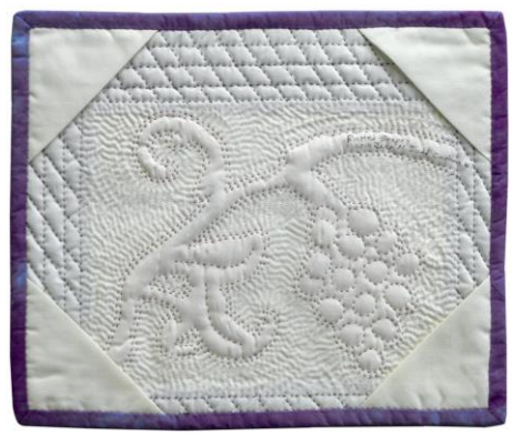
View of back of artwork