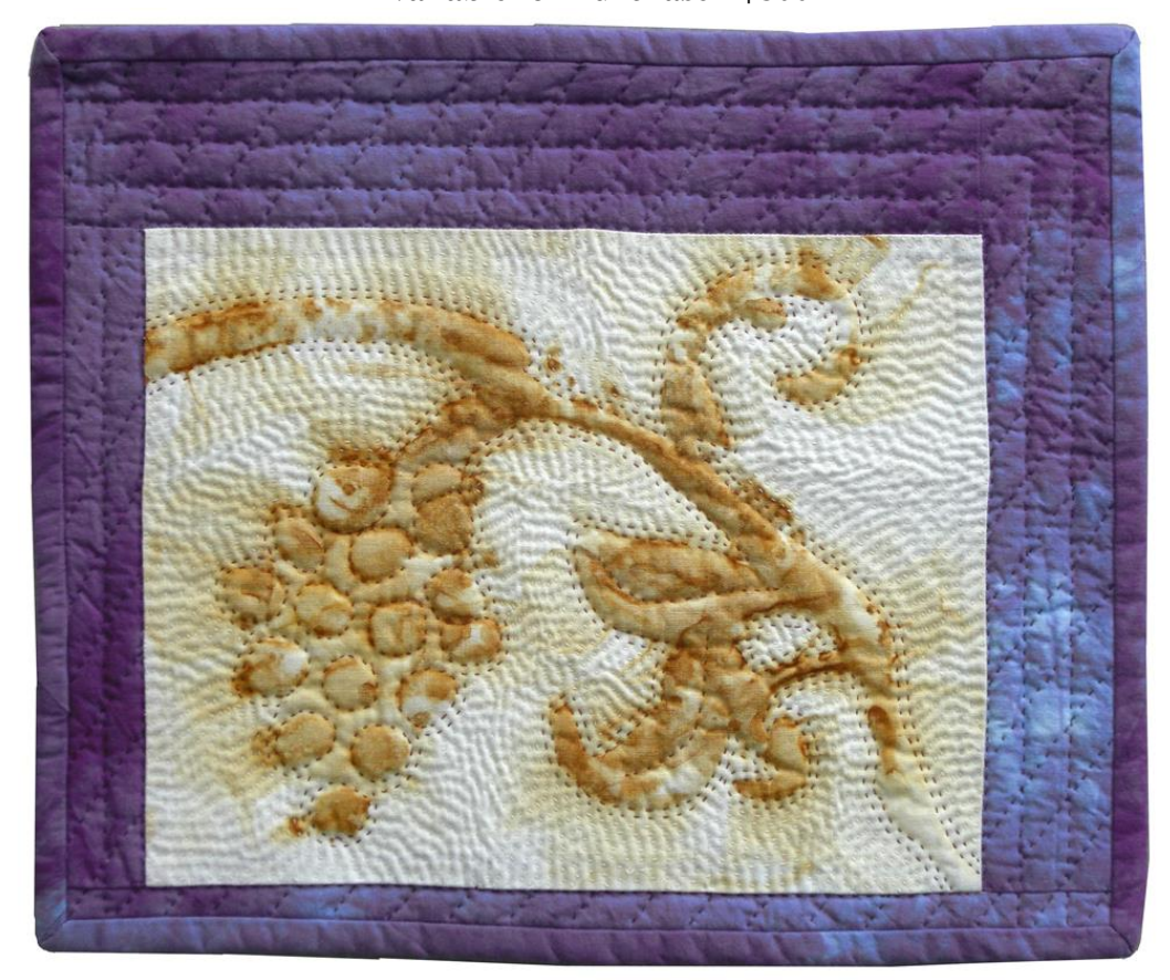
Exhibition and Publication History

Rusted Grapes (10.25" x 12.25"/ 25.5 x 30.5cm) (c) 2009-2010 Jean M. Judd/Artists Rights Society (ARS) New York Hand Stitched Thread on Hand Dyed Rust Pigmented Textile **Available for Purchase - $800**